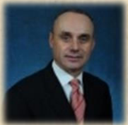
Robert D. Manfred, Jr.